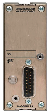
SIM928 rear panel